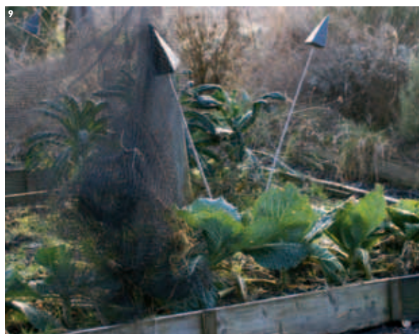
9 The nets protecting the raised beds of brassicas, including cavolo nero and cabbage 'Castello' F1 are laid back to allow for weeding.