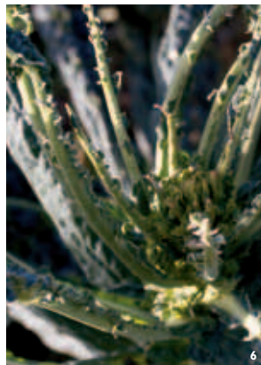
5 Cleve hangs bird seed at the top of a pole that has been greased to keep squirrels away. 6 Cavolo nero, a favourite winter vegetable, unfortunately fell victim to hungry pigeons. 7 Fruit trees were planted as part of a community orchard being developed on a neighbouring plot – the perfect opportunity to keep local cultivars alive.